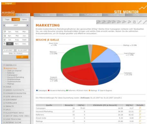
Interface Site Monitor