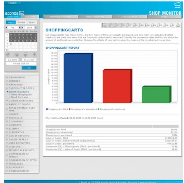
Shopping carts analysis

By using the Quick Manual activation is easily possible with other shoppystems as well.